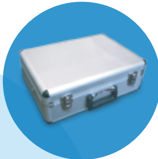
Lightweight carrying case