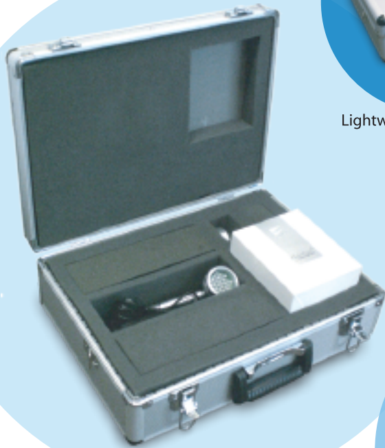
Portable handpiece(s) & skincare products