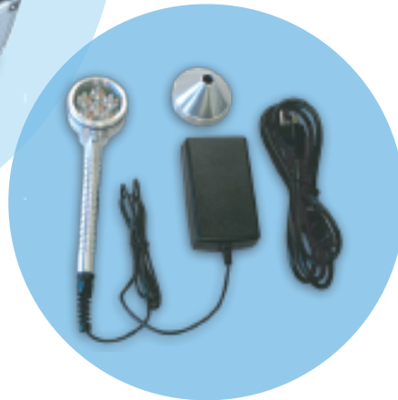
Handpiece, focusing cone & power cord